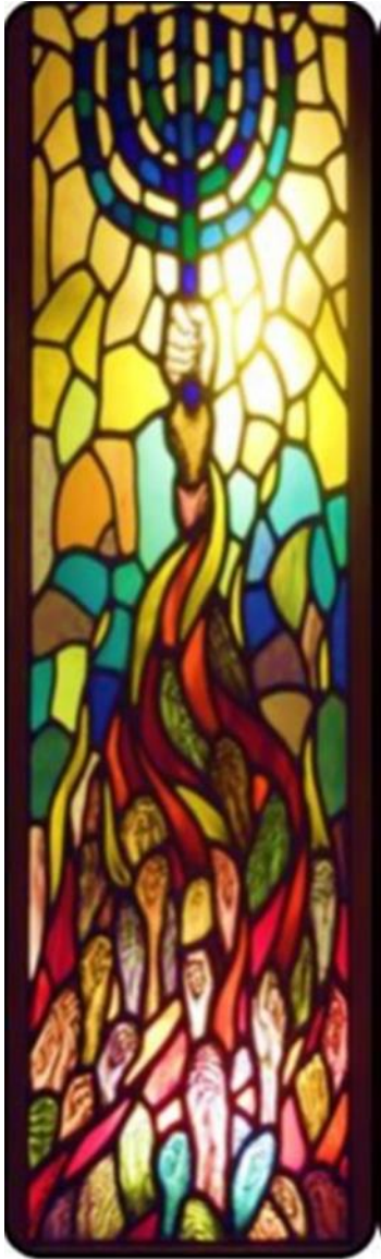
Figure 1: Glass artefact in Bitachon.

how Jewish members of non-residential day centers reconcile past traumas with the present day. Departing from related Jewish ethnographic studies of aging and space, this paper describes how the service at Bitachon offers the members a token and taste of their pre-war lives from a time before the Shoah and the personal as well as collective tragedies which ensued.