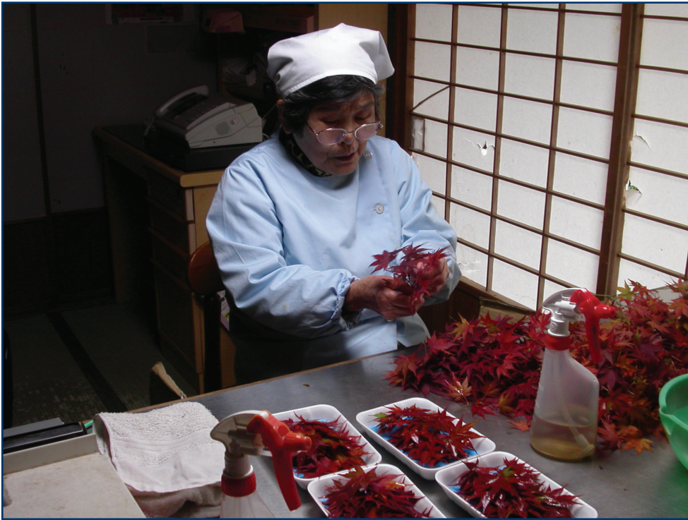
Photo 2: A woman prepares and packages leaves

At last, he found several farming households whose female members agreed to cooperate with his plan. The various kinds of leaves collected by the women—all in their 60s—were loaded by Mr. A in the agricultural cooperative's automobile, which he drove to Osaka and Kyoto in an attempt to peddle them at several markets. In the beginning, Mr. A found difficulty in grasping consumers' needs, such as the form of a leaf, color, size that are called for each season. Reluctantly, he made repeated visits to restaurants where leaves were actually being used in cooking. Bit by bit, he learned how to choose and arrange leaves that would be seasonal and those that would bring out the best flavor of the food.