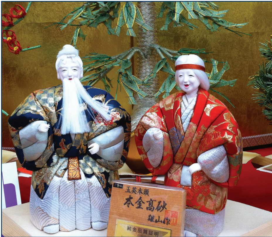
Photo 1: Japanese dolls of an older man and woman in traditional silk kimono

(Matsutani & Fujimasa 2002: 94-99). This is because in Japan, the ability to continue work and other roles is a significant factor contributing to the well-being of the older adult. According to one international comparative study on the traits of the aged in five countries, the older adult in Japan have a greater tendency to attach importance to having a paid job and to getting along well with their neighbors (Maeda 2006; Yuzawa 2003:176). In the history of Japan, the older adults have important roles working in the community, such as tending pineland and caring for and educating children (Miyata et al ed. 2000:22; Miyamoto 1984:33-43) (Photo 1). Aging and depopulation may deprive both older adult and younger generation of the opportunity of cultivating inter-generational relations (Thang 2001), and going through life as a whole.