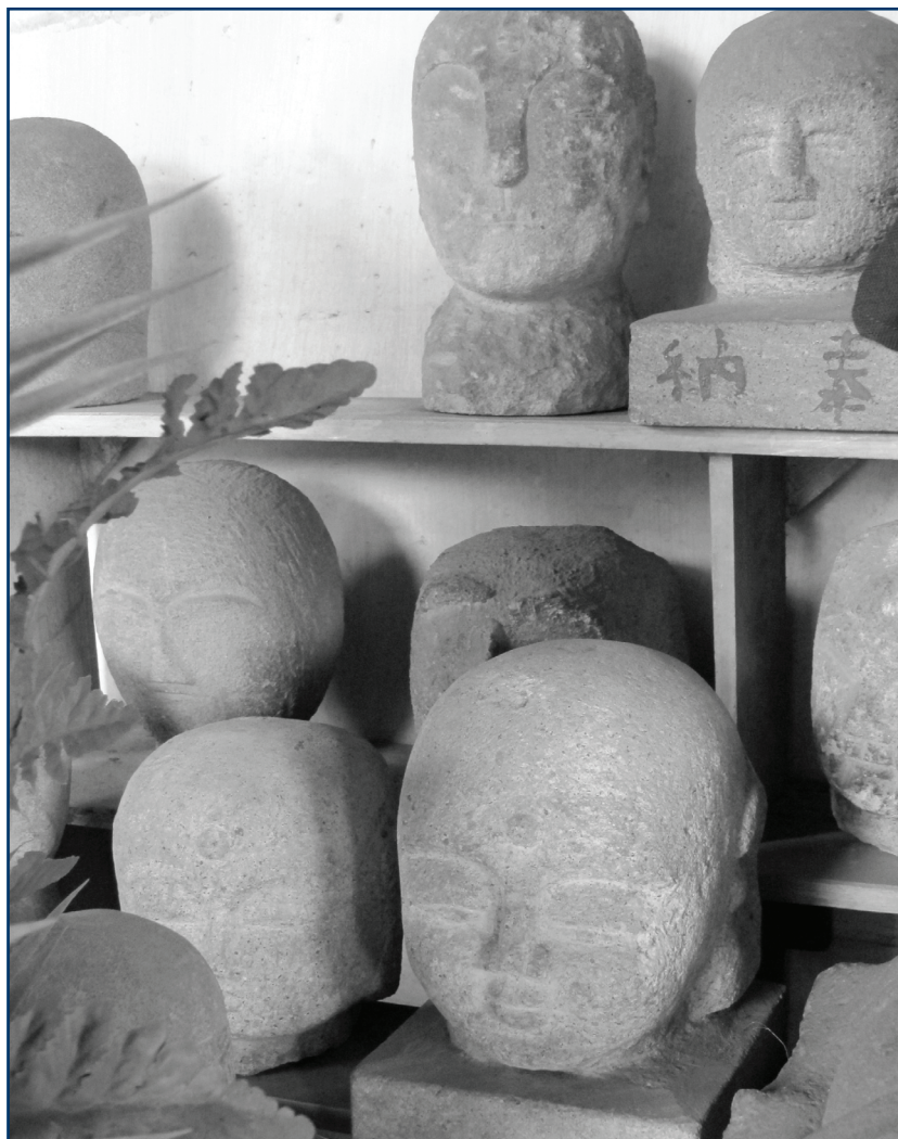
Photo 5: A close-up of the ex-voto heads at Gangyō temple

Thus, every hypothesis presents a contradiction between belief and practice. Worshippers do not appear to have noticed these contradictions, even though they place their lives in the hands of the aging Jizō statue. They entrust their fates to him yet do not examine the nature of the sacred objects to which they pray. Worshippers leave their wishes in the hands of O Jizō-sama, an obscure presence, whose facial expression might belong to one of the worshippers, without apparently philosophizing about Jizō's identity or the nature of its sacred power.