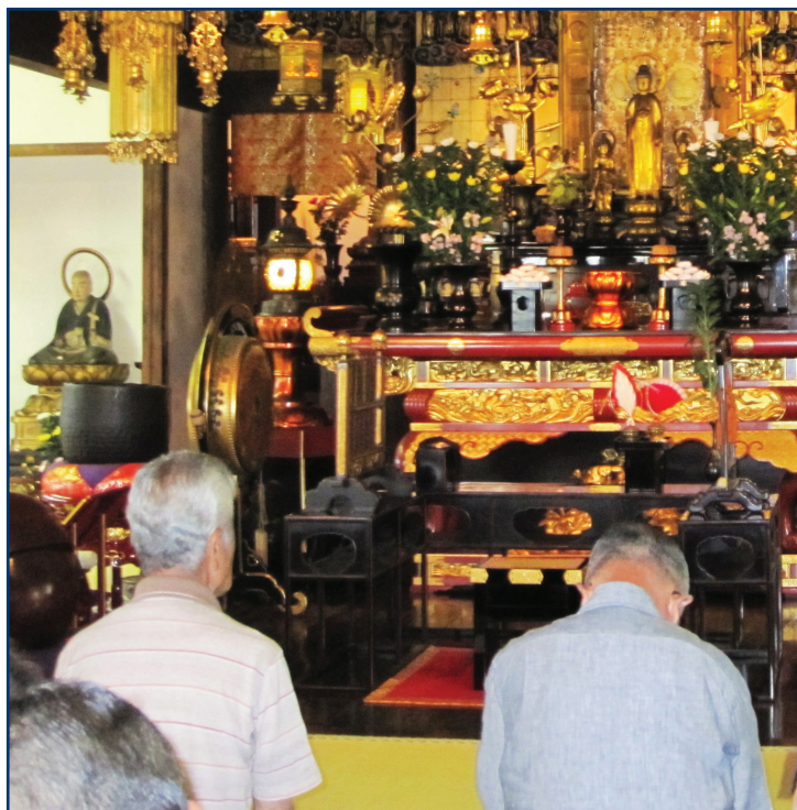
Photo 3: Older worshippers gathered in the main hall of Gangyō temple

seminaries for Buddhist priests granted the light of Hōnen Buddhism. Amitābha, Guanyin, and Mahasthamaprapta are enshrined inside the main sanctuary as the primary objects of worship (Photo 3). The temple is 6,270 square meters; besides the main sanctuary, it has other buildings, such as an ossuary and a shrine for the statue of Bound Jizō.