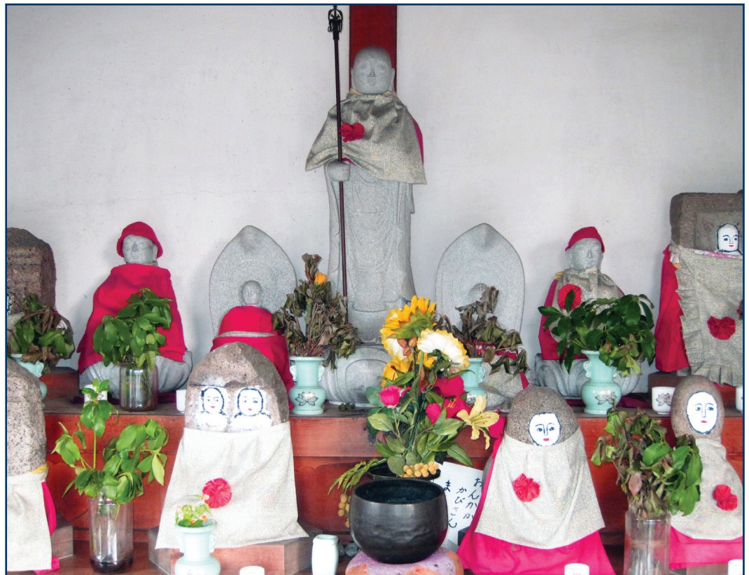
Photo 1: A variety of Jizō statues with offerings of flowers and water, wearing bibs donated by worshippers

image of older adults prevents them from behaving as they really are, and hence, from being their "authentic self" (George 1998) or "the true self" (Biggs 1999) because they internalize or reflect the gaze of others. This paper deals with materials and older adults in the light of authenticity as well, but from a different perspective: by examining the statue in a personified way – in terms of its close relationship with elderly worshippers seeking their own identities – in order to reconsider the model of human nature and successful aging.