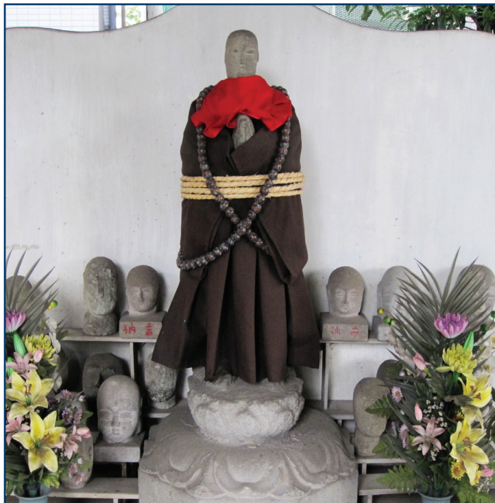
Photo 4: The Bound Jizō with the removable head at Gangyō temple

As the photograph shows, this statue does not appear headless. Its body and head are in fact not connected: the head just rests on the body, and the juncture is covered by a scarf. Some of the worshippers I interviewed told me that they occasionally found the statue headless. This unusual phenomenon is closely related to the way vows are made through this statue.