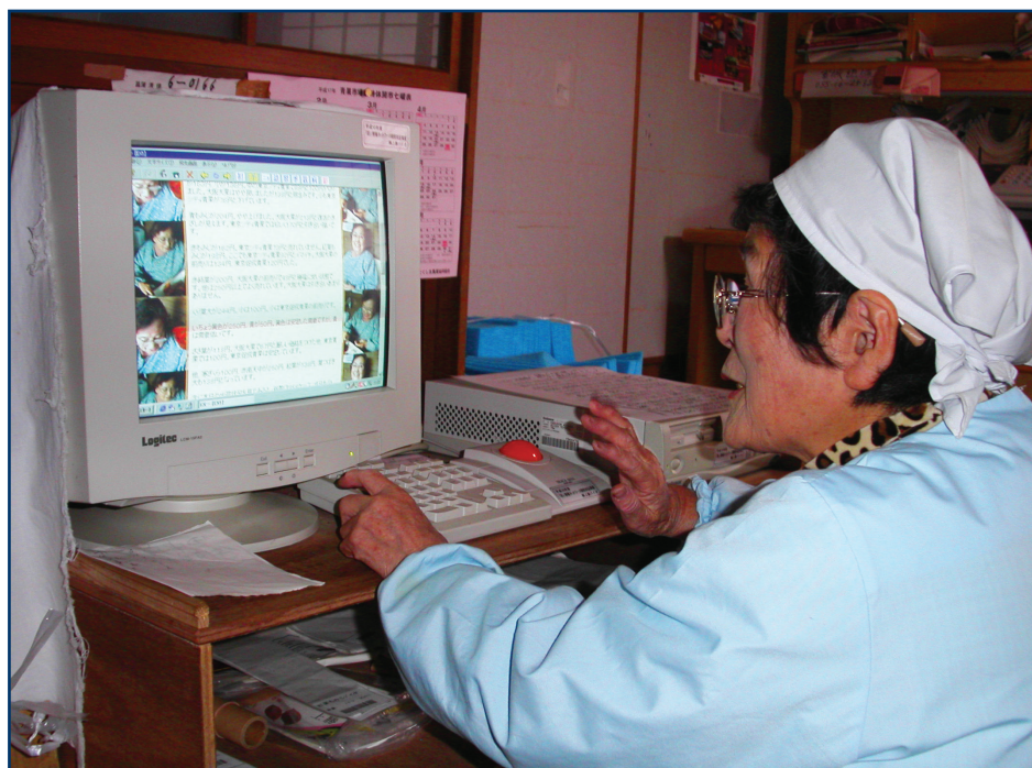
Photo 3: Using a computer with a trackball device to receive and send out information on deliveries

be utilized to equitably get information sent out to the people participating in the leaf production. For people living and working in scattered mountain areas, the simultaneous-broadcast wireless system has been utilized to inform townspeople of emergencies and other important matters. This time, a new system was organized by which the disaster fax service could be used to send out information to the leaf producers, forming a network that allowed everyone to quickly acquire information such as requests for shipments, etc. That way, information about seasonal leaves in demand including the copy of leaf samples that help the producers easily adjust the form of a leaf, a color, a size, to a standard, are sent swiftly and simultaneously to all the farm households registered as leaf producers.