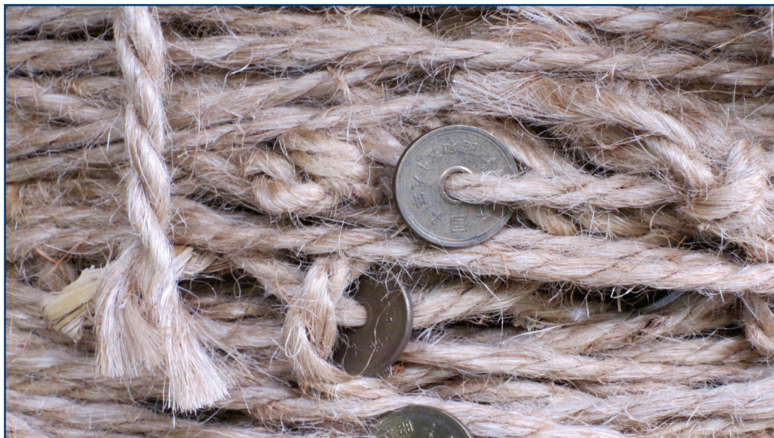
Photo 2: A close-up view of the five-yen "goen" coins on the ropes of the Bound Jizō representing a wish

cut off an intended victim's head because Jizō appeared and was beheaded in his place. Most headless Jizō statues, though, become headless through age. Their foundations loosen, and they fall and break during typhoons and heavy rainfall. The broken statues are then put back together, their heads placed on their bodies and offerings of red aprons tied around their necks.