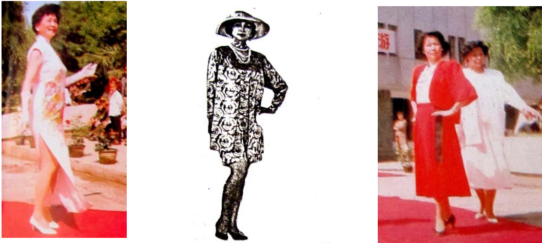
Figs.4-7: 1990's Chinese Magazine Photos of Middle Aged and Elderly Fashion. Traditional Chinese qipao (far left) ; “Western-style” upscale dress (middle) ; Western suit sets and bold color (right).

58-year old retiree “whose prime years were spent in a Mao suit,” could now achieve fashion acclaim.