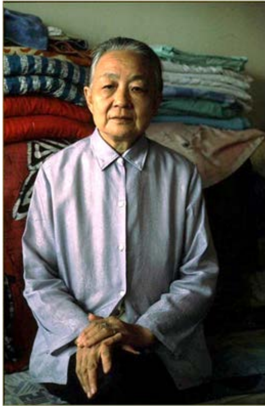
Fig 3: Elderly Beijing Woman in early reform-era modified dress, mid-1990s

Of numerous period articles in China Woman on older women's appearance, I discuss three which are representative of the kinds of messages common in ACWF articles at the time. These pieces illustrate how older women were now urged to cultivate an appearance that was feminine, cosmopolitan, attractive, and youthful, often in ways unanticipated by western feminist theory.