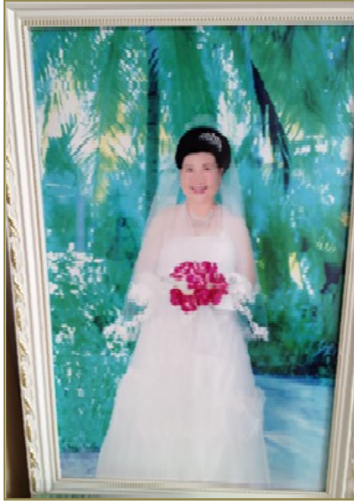
Fig 10: Reform-era contemporary wedding photo.

married, so naturally I started thinking about it. When I got married, even what my maternal uncles and aunts gave me were all Quotations of Chairman Mao [books]. All the gifts were like that – lots of Mao pictures ...and Mao badges. ...Back then, could you perm your hair? No way! If I wanted to just brush my hair into long braids, even that was not permitted! Really! My braids were really long, but ...they cut my hair short, and all I could do was comb it flat against my head.