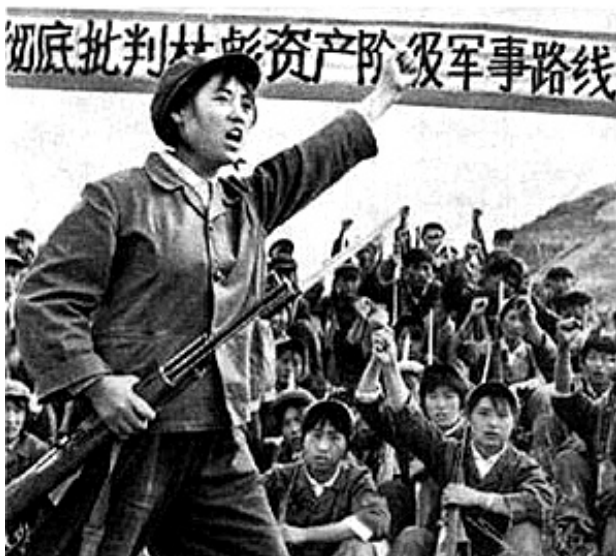
Fig.1-2: Cultural Revolution-style clothing from the early 1970s.

During the Maoist era (1949-1976), Communist Party Chairman Mao Zedong ruled, and the status hierarchy was flipped on its head from pre-revolutionary times. People with land, money, white-collar professions, conspicuous consumption, cosmopolitan habits, foreign ties, or patriarchal gender roles were socially demoted (Gao 1987). Values shifted to favor the broad masses of peasants and simple consumption habits, and efforts were made to reduce gender inequalities by showing that “women can do anything men can do” (Gilmartin 1994). While rapid modernization in farm, factory, and scientific work meant that some older people had difficulty keeping up, during the 1950s the widespread expectation remained that elders should be respected. Early on, women whose families had means still wore elaborate brocade qipao dresses at special occasions like weddings, but in everyday life, a new proletarian aesthetic and continuing poverty meant that most people wore simple homespun clothes and hand-made shoes. For females, this could include clothing with flowery patterns and shoes with embroidery, if time and budget allowed. While some older women cut their hair short, one was allowed to keep long hair, with girls plaiting it into two braids and women putting it back in a braid or bun. Over time, family life became increasingly subordinated to the communist work unit, with the sway of families reaching low ebb in the Great Leap communes (1958-1961) and Cultural Revolution.