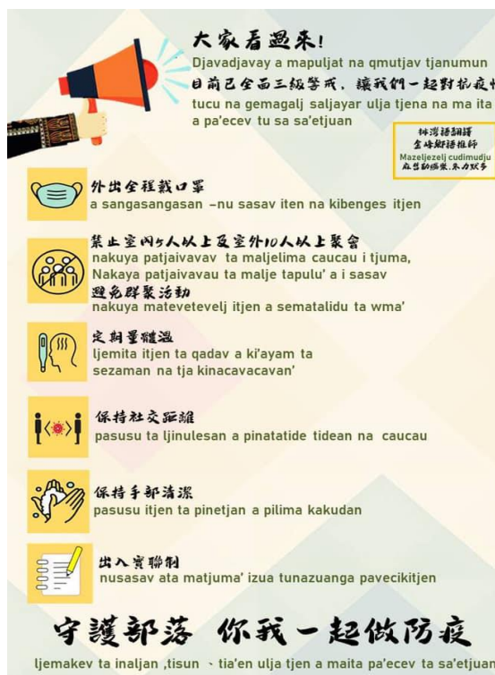
Image 2. Pandemic prevention regulations for a Paiwan tribe.

Beside this, foods believed to have antiviral properties (e.g., onions, ginger, and Chinese scallion) were collected in the tribes and added to meals. The tribal chiefs played music for cardiovascular exercise throughout the villages to encourage the elders to leave their homes and exercise.