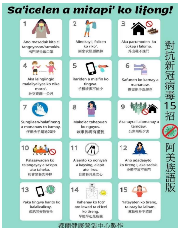
Image 1. Pandemic prevention regulations in A'tolan Amis.

means “Remember to wear a mask when you go out,” and “7. Sungilaen/ halafineng a mananaw to kamay” means “Wash your hands thoroughly for longer than 20 seconds.” Image 2 shows a poster from a Paiwan tribe: “Pasusu ta ljinulesan a pinatatide tidean na caucau” means “Maintain social distance,” and “nakuya matevetavel itjen asematalidu ta wma” means “Avoid group activities.” These posters helped older adults understand more about COVID-19, and ultimately served to protect them.