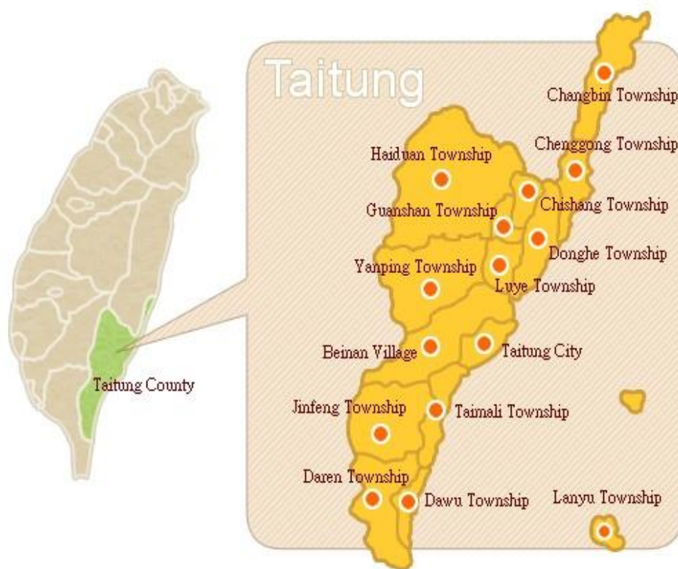
Figure 1. Map of Taitung County (Council of Indigenous Peoples. 2022b).

As humans live longer, growth in the number of older adults worldwide is unprecedented. Taitung County is a rural area located in eastern Taiwan. It also known as ‘back mountain,’ which means that Taitung County lags far behind other areas in all aspects of its development. In 2021, the population of Taitung was 213,386 people, 16.65% of the Taitung population was 65 years or older, which is higher than the average in Taiwan. Moreover, the average life expectancy (75.79 years) is the lowest in Taiwan (Lee et al. 2021). One-third of the population of Taitung is indigenous (about 78,463 people), and there were 23,186 indigenous adults over 55 years of age. Taitung has the highest proportion of indigenous people of any county in Taiwan (Council of Indigenous Peoples 2022a). There are seven ethnic groups (e.g., the Amis, Puyuma, Bunun, Tao, Paiwan, Rukai, and Kavalan) and 183 tribes (Liu, Kuo, and Lin 2018). The indigenous culture has been well preserved within the county because Taitung developed relatively late. Among the 16 townships in Taitung, only one has no indigenous people (Green Island Township), and the remaining 15 have indigenous tribes (Taitung County Government 2022).