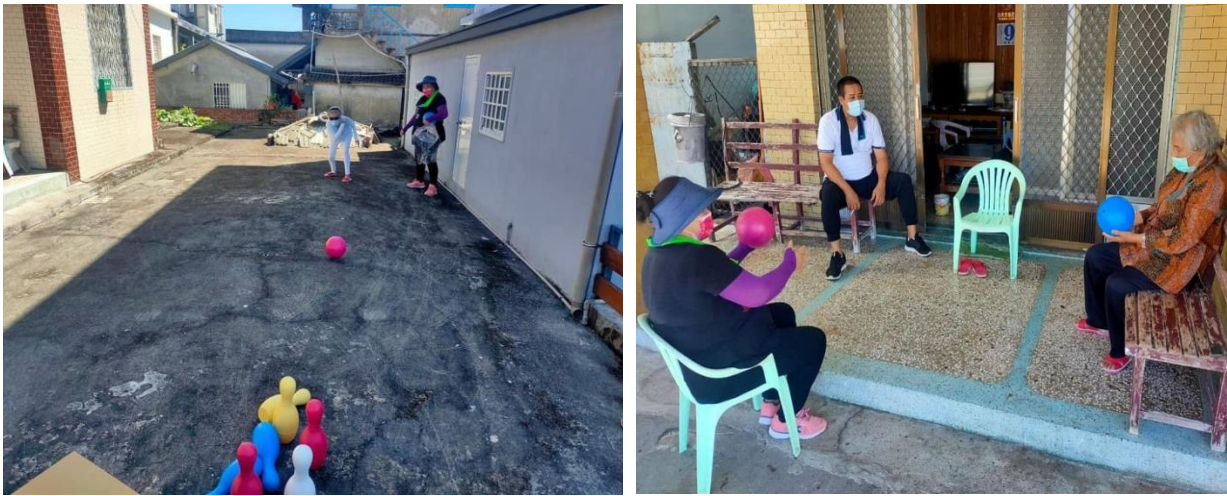
Images 3 and 4. Care providers playing bowling and ball games with elders in their homes during COVID-19.

Several services were also offered during meal delivery; e.g., in order to maintain elders' hand function, arts-and-crafts kits were delivered along with the meals. The care providers explained the crafts and arranged a date to collect the result; this was an example of suspending classes but not the learning process.